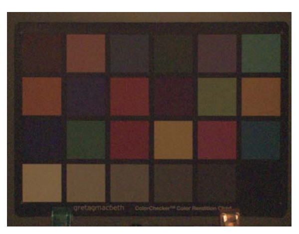
10lx, Gain Analog 18 dB, Gain Digital 6 dB