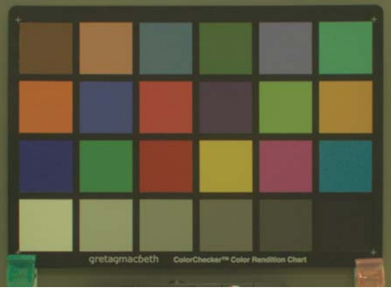
2500lx, Gain Analog 6 dB